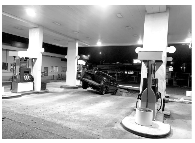
Figure 1. Abandoned Gas Station, Seattle, Washington