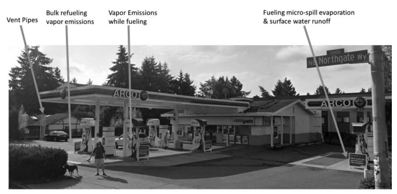
Figure 2. Gas Station Air Pollution Pathways